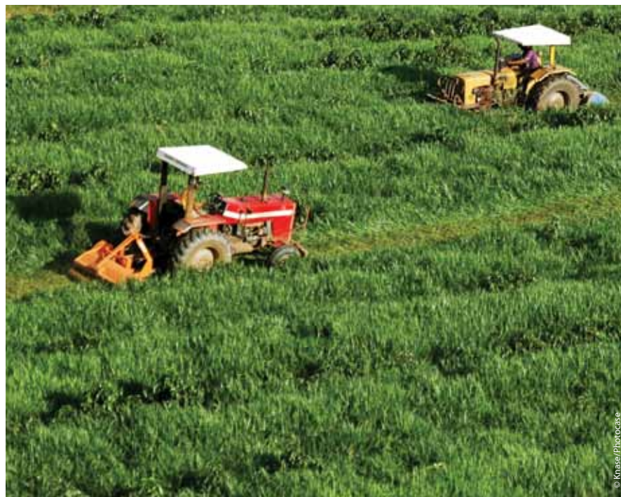
Brazil's agriculture is extremely diversified and the country is largely self-sufficient in terms of produce. Brazil is the world's largest producer of sugar cane, coffee, tobacco, cocoa, soya beans, orange juice, and other tropical fruits and nuts.