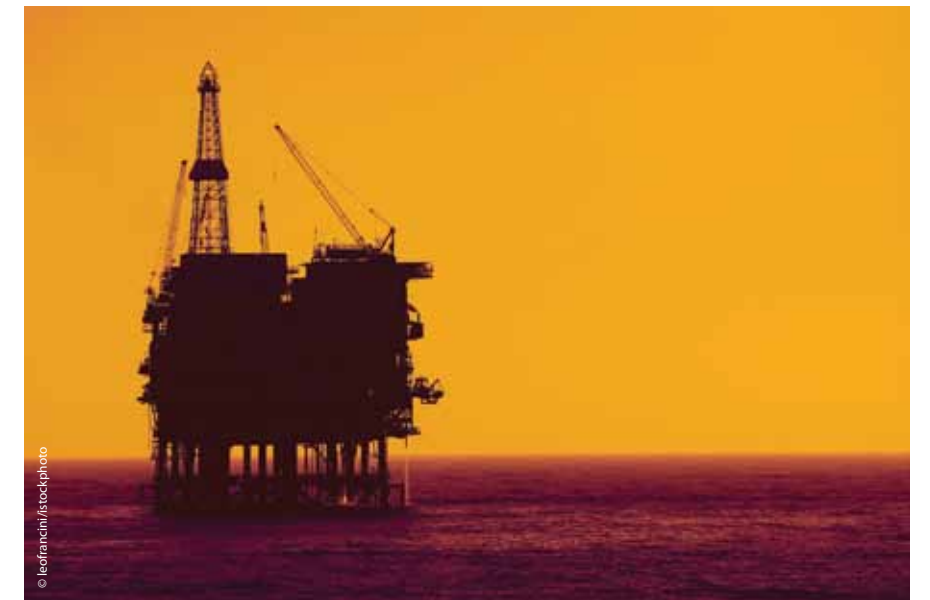
Discovery of a group of deep-sea oil deposits 200 miles out into the Atlantic will transform Brazil's state-controlled energy company, Petrobras, into a major global energy player.

While for reasons of proximity Latin America remains a key market and the U.S. is unlikely to lose its significance any time soon, the changing world order means that Africa and particularly Asia have moved up Schaefer's and his agency's agenda. "We are opening an office in Angola this year, and